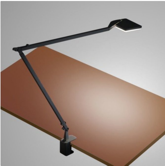
Shown in: Black

The Jackie Clamp Table Lamp is constructed of cast aluminum alloy in a Titanium, White, Black, or Red finish. Double jointed for maximum adjustability. Includes integral LED driver with 5 step touch dimming. CSA certified, listed to UL & CSA Standards. Manufactured in Italy by Panzeri.