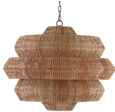
Shown in khaki / natural

Carefully woven using traditional artisan techniques, the Antibes Chandelier is a fusion of artistry and high-quality construction. Natural rattan forms the body of this geometric chandelier supported by a wrought iron frame. Though the Antibes will feel right at home in a coastal aesthetic, it is also perfect for modern interiors.