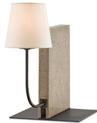
Shown in aged steel / off-white linen

LUMENS/WATT . . . . . 7.20 LUMINOUS FLUX . . . . . 180 lumens