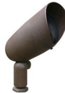
Shown in: Bronze

BUL16 LED 25 Degree or 35 Degree Bullyte with Mounting Stake housing is fabricated from a one piece injection molded high performance polymer composite with fully rotatable gasketed shroud and fully adjustable swivel arm with vibration proof locking teeth. Clear tempered glass affixed at 10 degree angle for natural cleaning. Includes 1.4 inch diameter x 9.5 inch length S7 PVC mounting stake. Fixture features integral .5 inch NPS fitter. Available in a 25 and 35 degree beam spread option. Pre-wired with 3 foot pigtail of 18-2 AWG wire. Includes low voltage quick connector LVC3 for easy hook up to the low voltage supply cable, sold separately. ETL listed for wet locations. Note: Required low voltage remote transformer and optional mounting accessories sold separately.