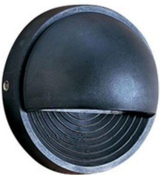
Shown in: Black / Frosted

DUL1 LED Composite Wall Mount Decklyte is fabricated from a one piece injection molded high performance polymer composite with stainless steel fasteners. Composite is textured, pressure formed, molded in color in Black or Bronze. Frosted, annealed glass lens with reflector in a stamped hammertone aluminum. Includes one 12 volt, Philips 1.2 watt G4 capsule LED lamp, 105 lumens. Comparable to a 10 watt halogen lamp. 15,000 hour average lamp life. Pre-wired with a 6 foot pigtail of 18-2 AWG. Includes low voltage quick connector LVC3 for easy hook up to the low voltage supply cable, not included. 3.5 inch diameter x 1.9 inch depth. ETL listed for wet locations. 5 year limited warranty. Requires remote transformer, sold separately.