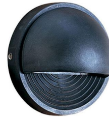
Shown in black / frosted

DUL1 LED Composite Wall Mount Decklyte is fabricated from a one piece injection molded high performance polymer composite with stainless steel fasteners. Composite is textured, pressure formed, molded in color in Black or Bronze. Frosted, annealed glass lens with reflector in a stamped hammertone aluminum. Includes one 12 volt, Philips 1.2 watt G4 capsule LED lamp, 105 lumens. Comparable to a 10 watt halogen lamp. 15,000 hour average lamp life. Pre-wired with a 6 foot pigtail of 18-2 AWG. Includes low voltage quick connector LVC3 for easy hook up to the low voltage supply cable, not included. 3.5 inch diameter x 1.9 inch depth. ETL listed for wet locations. 5 year limited warranty. Requires remote transformer, sold separately.