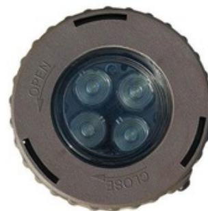
Shown in: Bronze

IUL516 LED Composite Inground Uplight is fabricated from one piece injection molded high performance polymer composite. Composite is textured, pressure formed, molded in color in Bronze. Lens ring is a single piece injection molded high performance polymer with gasketed lens and twist off operation for ease of maintenance. Clear convex, tempered glass furnished with silicone O-ring for watertight seal. Includes one 7 watt 12 volt GU5.3 MR16 LED lamp with 25 degree beam spread, 3000K color temperature, 460 lumens. 25,000 hour average lamp life. Pre-wired with 3 foot pigtail of 18-2 AWG wire. Includes low voltage quick connector LVC3 for easy hook up to the low voltage supply cable, sold separately. 4.1 inch diameter x 4.4 inch height. ETL listed for wet locations. 5 year limited warranty. Requires remote transformer, sold separately.