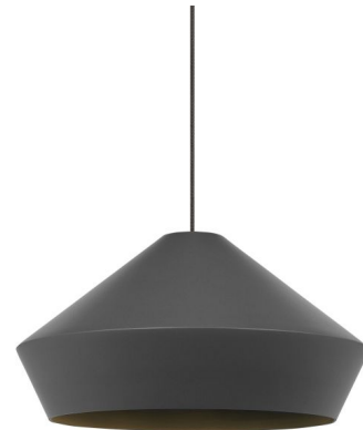
Shown in satin nickel / matte charcoal gray