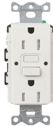
Shown in gloss white

The 120 Volt GFCI (ground fault circuit interrupter) Tamper Resistant Self-Testing duplex receptacle is for use in areas where a short circuit or threat of electrical shock may occur due to wet conditions. Tamper-resistant shutter mechanism. Test/reset button automatically checks every 30 seconds to ensure the unit is functioning properly. Clear visual indication of GFCI status with LED indicating lights. Available in a 15 amp or 20 amp in gloss and satin colors. Note: Designer wall plate sold separately. NOTE: 20 Amp available in satin colors only.