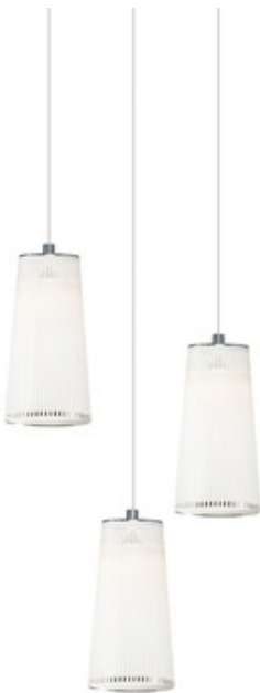
Shown in: Nickel / White

DESCRIPTION The Solis Chandelier, designed by Carmine Deganello, set out to engage with light in its archetypal form: the sun's rays. The resulting piece is an engaging blend of light and shadows, casting shimmering rays and radiating patterns onto a space. The effect is a sense of weightlessness and a redefined environment that invites a new kind of relationship with the light source. Includes 16 foot field cuttable suspension cable. UL listed components. CE listed.