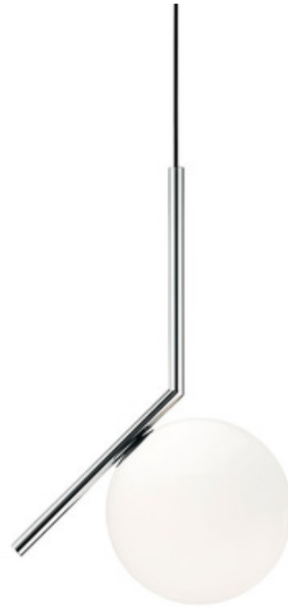
Shown in: Chrome / Opal

The IC Pendant, designed by Michael Anastassiades for Flos, features diffused light with an Opal glass diffuser and a Chrome, Red Burgundy, Black, or Brass finish. Available in two sizes. Canopy diameter: 4.3 inch. UL listed.