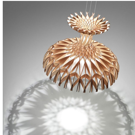
Shown in matte white / natural wood

The Dome 90 Pendant is made of hundreds of puzzled wood pieces in Beech natural wood veneer with a Matte White or Matte Black finish. The LED light source is above the wooden structure to illuminate throughout the open and diffused portions casting beautiful shadow patterns on surfaces below. An additional light allows for more focused illumination on the surfaces below, while the upperlight provides ambient light. ETL and CE listed.