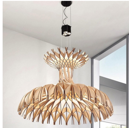
Shown in matte white / natural wood

The Dome 180 Pendant is made of hundreds of puzzled wood pieces in Beech natural wood veneer with a Matte White finish. The LED light source is above the wooden structure to illuminate throughout the open and diffused portions casting beautiful shadow patterns on surfaces below. An additional light allows for more focused illumination on the surfaces below, while the upperlight provides ambient light. ETL and CE listed.