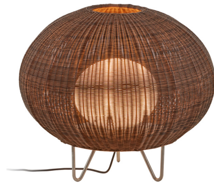
Shown in stainless steel / brown

The Garota P01 Outdoor Floor Lamp features a tripod stand structure made of stainless steel 316 that can withstand exposure to the elements. Lamp shade is made of hand wrapped polyethylene synthetic fiber over aluminum frame, available in Brown or Ivory White. Two 20 watt, 120 volt medium base triple tube compact fluorescent bulbs are required, but not included. Light source is protected by a frosted, polyethylene globe of medium density and UV protection. Cord is protected with waterproof neoprene coating. Cord length 149.61 inch with no switch. ETL listed. IP55 rated for wet locations. 28.35 inch diameter x 24.02 inch height.