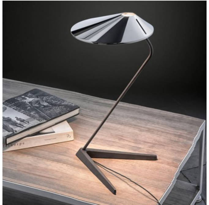
Shown in: Chrome

The Non La Table Lamp features a conical asymmetrical conical shade made of aluminum in Chrome, Brilliant Copper, or White Brilliant Lacquer finish. Cast iron base. Includes polycarbonate diffuser to cover the light source. Touch dimming switch under the lamp head offering three dimming levels. Includes thirty-five 0.3 watt LEDs totaling 10.5 watts, 2700K color temperature, 90CRI, 1200 lumens. ETL listed. 18.5 inch height x 10.43 inch depth with a 64.96 inch length cord.