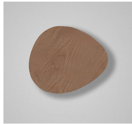
Shown in natural oak

The Tria Single Wall Light features a frontal shade made of a wood material in White satin lacquer or NaturalOak. Shade can be slightly moved to offer a suggestive play of light and shadow around the organic shape of the diffuser. The inner structure is composed of a metal tube finished in white paint. Available in three sizes. ADA compliant. ETL listed.