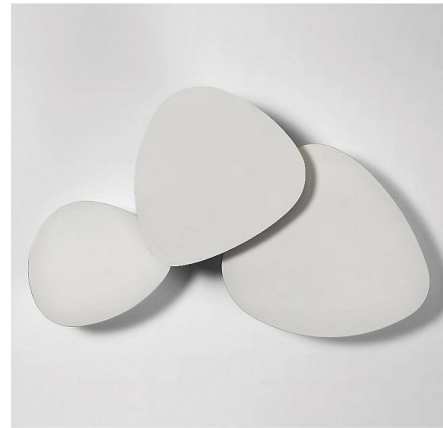
Shown in white satin lacquer

The Tria Wall Light is a modular system composed of LED plates, with frontal shades made in White Lacquer or Natural Oak that can be slightly re-positioned for added shadow play. Shades may be mounted as a modular unit or individually. Available finished in White Satin Lacquer, Natural Oak, or Natural Oak and White Satin Lacquer. CE and ETL listed.