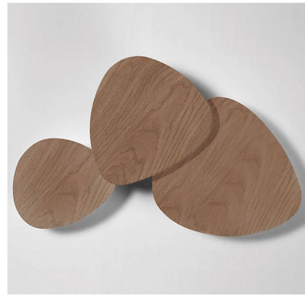
Shown in natural oak

The Tria Wall Light is a modular system composed of LED plates, with frontal shades made in White Lacquer or Natural Oak that can be slightly re-positioned for added shadow play. Shades may be mounted as a modular unit or individually. Available finished in White Satin Lacquer, Natural Oak, or Natural Oak and White Satin Lacquer. CE and ETL listed.