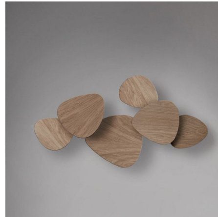
Shown in natural oak

The Tria Wall Light is a modular system composed of LED plates, with frontal shades made in White Lacquer or Natural Oak that can be slightly re-positioned for added shadow play. Shades may be mounted as a modular unit or individually. Available with 6 or 8 face plates finished in White Satin Lacquer or Natural Oak. CE and ETL listed.