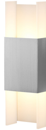
Shown in brushed aluminum / frosted

The Ansa Wall Sconce is a simple form that has been detailed and executed without compromise. The robust metal collar broadly trains the light while the light diffusing blades closely attenuate the wash pattern on the wall yielding a simple and sophisticated feel. Ansa features a Brushed Aluminium, Brushed Brass, Distressed Brass, or Oiled Bronze band surrounding a Frosted polymer diffuser with 2700K or 3500K color temperature options. ADA compliant. UL listed. Made in the USA.