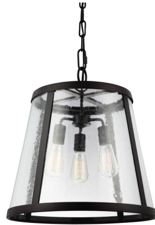
Shown in oil rubbed bronze / clear seeded

The Harrow 3 Light Pendant combines the traditional look of a tapered shade with popular finishes making this a great choice for many decors. Hang as a statement piece or hang several over an island, dining table or work station. Features an Oil Rubbed Bronze or Polished Nickel finish with Clear Seeded glass shade. Ideally suited for vintage style bulbs. Canopy: 5 inch diameter. ETL listed. suitable for damp locations.