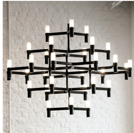
Shown in matte black / sandblasted glass

Crown Major Chandelier features a modular structure in die-cast aluminum and thirty sandblasted glass diffusers. Compatible with sloped ceilings up to 45 degrees.