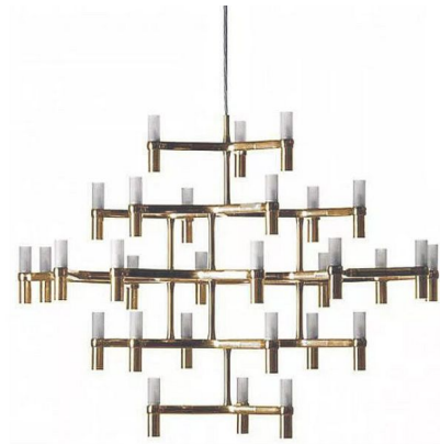
Shown in gold plated / sandblasted glass

LAMP COLOR . . . . . 2700K LUMENS/WATT . . . . . 2,000.00 LUMINOUS FLUX . . . . . 6000 lumens