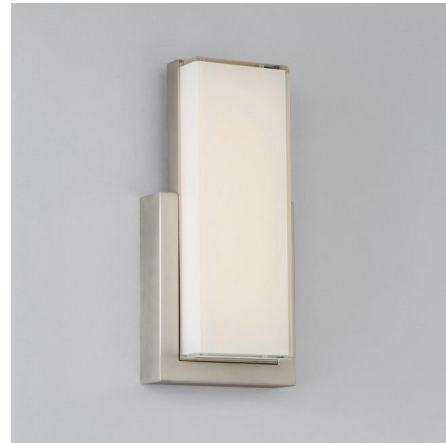
Shown in satin nickel / white

The Corbusier Wall Light features a White mitered ceramic glazed glass diffuser with a Satin Nickel finish. 5 year manufacturer warranty.