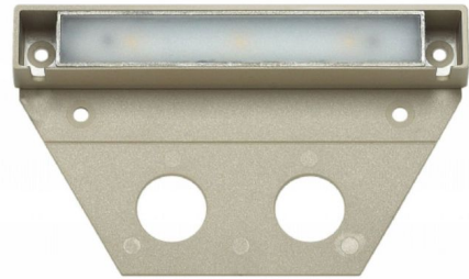
Shown in sandstone