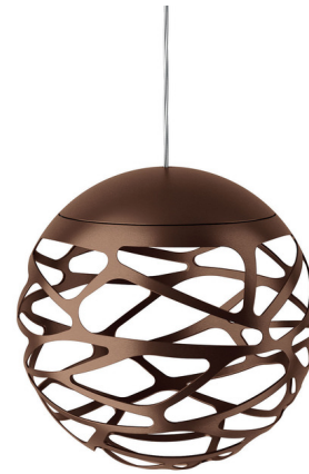
Shown in coppery bronze / milk white