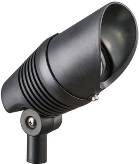
Shown in: Black / Clear

15382 Hybrid Accent Light is made of durable high heat thermoplastic composite resin with a Black finish and and fully sealed heat-resistant flat glass lens. Ideal for up or down lighting, cross-lighting, and grazing. Corrosion-resistant for harsh environments. One 35 watt max 12 volt MR16 GU5.3 base halogen bulb is required, but not included. Low voltage magnetic transformer required, sold separately. Not for use with electronic transformers. 3 inch width x 5 inch height x 6.5 inch length. 8 inch ground stake included. ETL listed for wet locations.