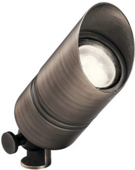
Shown in: Centennial Brass

Landscape 12V Accent Light is solid brass and commercial grade durable. Designed for harsh environments. ETL listed. Wet location rated. Required power supply and optional accessories sold separately.