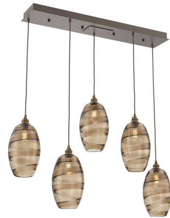
Shown in flat bronze / optic bronze

The Ellisse Linear Multi Light Pendant creates a magic dance of light across your interior space. The optic blown glass casts dramatic shadows all around while the clean finishes blend seamlessly into your room.