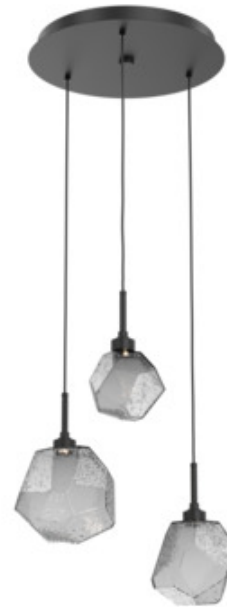
Shown in: Matte Black / Smoke

The Gem Round Multi Light Pendant is jewelry for your home. Features gems of LED lit hand blown glass that are meticulously crafted by Hammerton artisans. The fixture gives a nod to an organic aesthetic that exudes casual sophistication. Each shade takes the place of a traditional bulb and unfolds with striking illumination. The finished look is relaxed, soft and unique. Each glass shade is a one of a kind artisan creation.