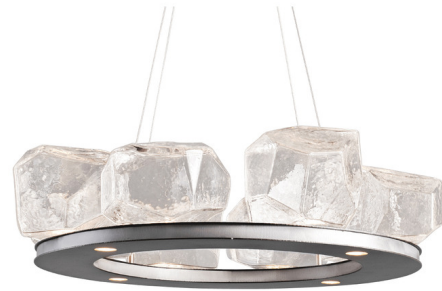
Shown in beige silver / clear

The Gem Ring Single Tier Chandelier is jewelry for your home. Features gems of LED lit hand blown glass that are meticulously crafted by Hammerton artisans. The fixture gives a nod to an organic aesthetic that exudes casual sophistication. Each shade takes the place of a traditional bulb and unfolds with striking illumination. The finished look is relaxed, soft and unique. Each glass shade is a one of a kind artisan creation. Available in three sizes. Canopy: 8 inch diameter.