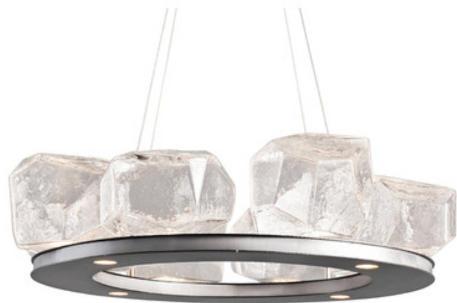
Shown in: Metallic Beige Silver / Clear

The Gem Ring Single Tier Chandelier is jewelry for your home. Features gems of LED lit hand blown glass that are meticulously crafted by Hammerton artisans. The fixture gives a nod to an organic aesthetic that exudes casual sophistication. Each shade takes the place of a traditional bulb and unfolds with striking illumination. The finished look is relaxed, soft and unique. Each glass shade is a one of a kind artisan creation. Available in three sizes. Canopy: 8 inch diameter.