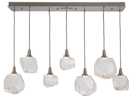
Shown in beige silver / clear

The Gem Linear Multi Light Pendant is jewelry for your home. Features gems of LED lit hand blown glass that are meticulously crafted by Hammerton artisans. The fixture gives a nod to an organic aesthetic that exudes casual sophistication. Each shade takes the place of a traditional bulb and unfolds with striking illumination. The finished look is relaxed, soft and unique. Each glass shade is a one-of-a-kind artisan creation.