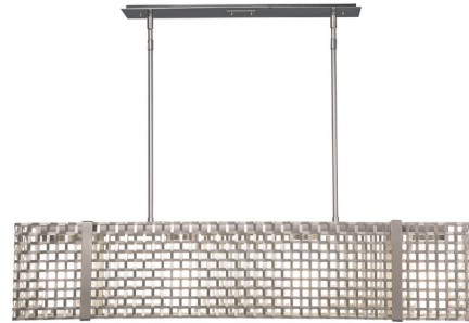
Shown in beige silver / frosted

The Tweed Linear Suspension is an industrial-inspired nod to the iconic fabric shade that evokes both strength and softness. Available with Frosted glass diffusers with a Flat Bronze, Gilded Brass, Matte Black, or Metallic Beige Silver finish. Two lamping options. INC: Four 60 watt max 120 volt medium base bulbs are required, but not included. LED: Four 5.2 watt 120 volt LED modules are included. 45 inch width x 9.8 inch height x 7.8 inch depth x 16.5-70.5 inch adjustable length. Length adjustable by 3 inch increments. UL listed. Made in the USA.