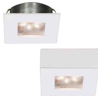
Shown in white

LAMP LIFE . . . . . 70000 hours COLOR RENDERING . . . . . 85 CRI LAMP COLOR . . . . . 3000K LUMENS/WATT . . . . . 32.29 LUMINOUS FLUX . . . . . 155 lumens