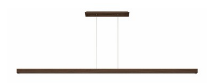
Shown in: Wood Walnut / No Louver

Glide Wood Downlight with Center Feed features a direct 1 inch flat milky white lens and a 60 degree beam spread. Available with a Black or White louver or without a louver. Wood options include Wood Maple, Wood Walnut, Wood Cherry, or Wood White Oak with Satin Nickel channel, or Wood Espresso with Black channel. All wood used in this fixture is sourced in the USA. Channel widths available in 12 inch increments from 36 to 120 inches. Custom widths available in 2.4 inch increments. Includes 7.5 watts per foot with choice of Very Warm White 2700K or Warm White 3000K color temperature, 92+CRI, or Neutral White 3500K, Cool White 4000K or Daylight White 5700K, 85+CRI. 50 lumens per watt/375 lumens per foot. Lumen values are based on the 3000K LED test without louver. 50,000 hour average lamp life. Includes rectangle canopy with 24VDC Class 2 LED power supply. Dimmable with an electronic low voltage dimmer: (Lutron Diva DVELV-300P, Lutron Skylark SELV-300P, Lutron Maestro MAELV-600 and Lutron Radio Ra 2, or Legrand Adorne ADTP703TU), sold separately. Includes adjustable 12 foot aircraft suspension cables. Two additional aircraft cables are added for support when channel lengths are wider than 96 inch. Includes Satin Nickel hardware and supporting cables. ETL listed. Major components made and assembled in the USA. 5 year warranty. Product is built to order.