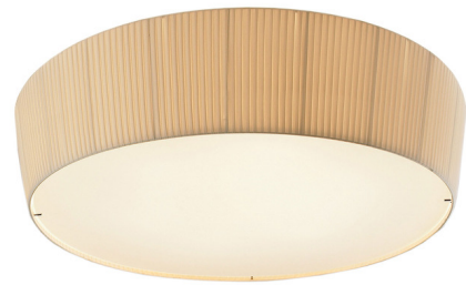
Shown in stainless steel / cream translucent ribbon

Plafonet Ceiling Flush Mount features a hand wrapped White or Cream translucent polyester blend ribbon shade, or a White cotton shade. Finish in Stainless Steel. Includes frosted polycarbonate injection-molded diffuser. Available in two sizes. Requires 60 watt 120 volt A15 medium base incandescent lamps, not included. UL listed. Dimensions: Small: 14.57 inch diameter x 5.91 inch height. Medium: 21.26 inch diameter x 5.91 inch height.