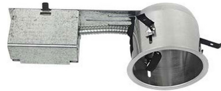
Shown in galvanized steel

R4-G19ICSRAT 4 Inch Shallow IC Airtight Remodel Housing is designed for use in 120V line voltage applications. Accommodates one 120 volt, GU10 MR16 LED bulb up to 10 watts, sold separately. Ceiling cut out 4.25 inch. For ceilings 1/2 or 5/8 inch. Note: A complete fixture requires a housing and trim, sold separately.