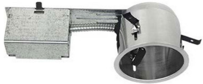
Shown in: Galvanized Steel

R4-G19ICSRAT 4 Inch Shallow IC Airtight Remodel Housing is designed for use in 120V line voltage applications. Accommodates one 120 volt, GU10 MR16 LED bulb up to 10 watts, sold separately. Ceiling cut out 4.25 inch. For ceilings 1/2 or 5/8 inch. Note: A complete fixture requires a housing and trim, sold separately.