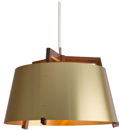
Shown in brushed brass / walnut

The Ignis Cord Pendant has been reduced to just frame and shade, highlighting the interplay of its components and accentuating the clean lines of its form. Available in various metallic shades with wood frame, in two sizes, with or without a diffuser to reduce glare. UL listed. Made in the USA.