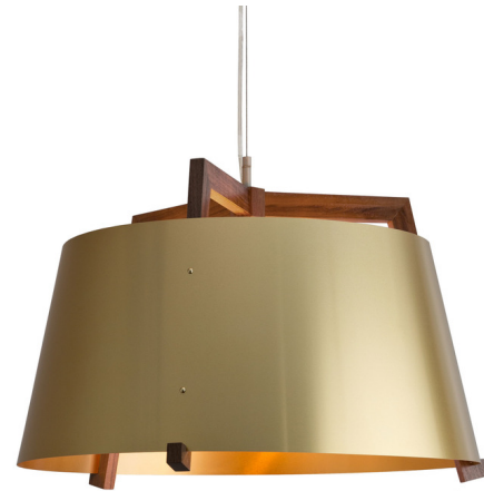
Shown in brushed brass / walnut

The Ignis Rigid Stem Pendant has been reduced to just frame and shade, highlighting the interplay of its components and accentuating the clean lines of its form. Available in various metallic shades with wood frame, in two sizes. Includes diffuser to reduce glare. UL listed. Made in the USA.