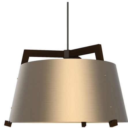
Shown in rose gold / dark stained walnut

The Ignis Rigid Stem Pendant has been reduced to just frame and shade, highlighting the interplay of its components and accentuating the clean lines of its form. Available in various metallic shades with wood frame, in two sizes, with or without a diffuser to reduce glare. UL listed. Made in the USA.