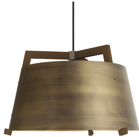
Shown in distressed brass / walnut

The Ignis Cord Pendant has been reduced to just frame and shade, highlighting the interplay of its components and accentuating the clean lines of its form. Available in various metallic shades with wood frame, in two sizes. Includes a diffuser to reduce glare. UL listed. Made in the USA.