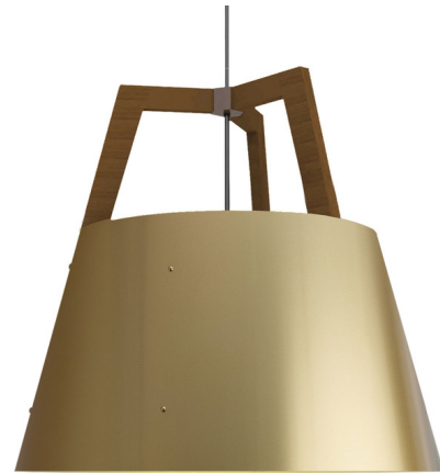
Shown in brushed brass / walnut

PRODUCT DIMENSIONS . . . . . Downrod: 72"