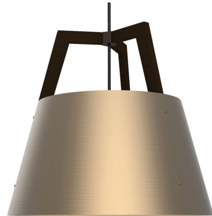
Shown in rose gold / dark stained walnut

The Imber Cord Pendant has been reduced to just frame and shade, highlighting the interplay of its components and accentuating the clean lines of its form. Imber is available in Distressed Brass with Walnut or Dark Stained Walnut accents, Brushed Brass with Walnut accents, or Brushed Rose Gold with Dark Stained Walnut accents, Matte Black with Walnut accents, Matte Black with White Washed Oak accents, Matte Black with Dark Stained Walnut accents, or Gloss White with White Washed Oak accents. Two sizes available. UL listed. Made in the USA.