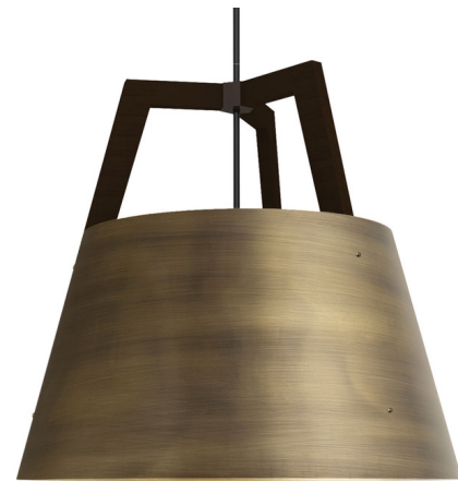
Shown in distressed brass / dark stained walnut

COLOR RENDERING 90 CRI LAMP COLOR 2700K LUMENS/WATT 96.15 LUMINOUS FLUX 1250 lumens