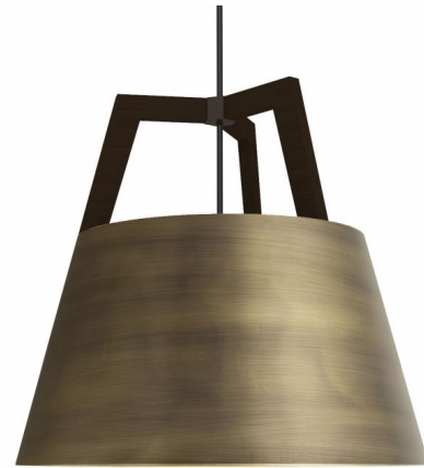
Shown in distressed brass / dark stained walnut

Imber Rigid Stem Pendant has been reduced to just frame and shade, highlighting the interplay of its components and accentuating the clean lines of its form. Imber is available in Distressed Brass with Walnut or Dark Stained Walnut accents, Brushed Brass with Walnut accents, or Brushed Rose Gold with Dark Stained Walnut accents, Matte Black with Walnut accents, Matte Black with White Washed Oak accents, Matte Black with Dark Stained Walnut accents, or Gloss White with White Washed Oak accents. Two sizes available. UL listed. Made in the USA.