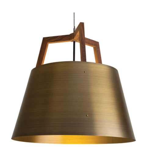
Shown in distressed brass / walnut