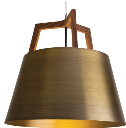
Shown in distressed brass / walnut

COLOR RENDERING 90 CRI LAMP COLOR 2700K LUMENS/WATT 96.15 LUMINOUS FLUX 1250 lumens