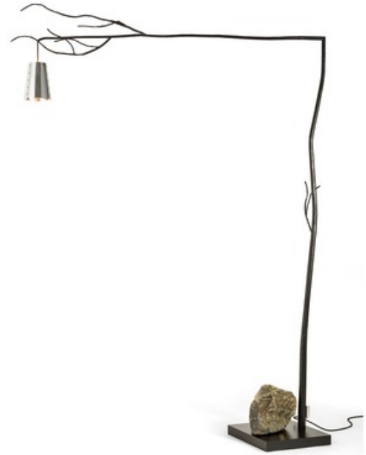
Shown in: Nickel

The Flintstone Floor Lamp returns to the beginning of times, back at the fireplace in the prehistoric cave. The tree branch and the stone, found at the end of this journey, are combined in this lighting object. Every stone is unique, and captures the emotion of eternity as well as being used as a functional counterweight. The branch arm of the Flintstone is movable, allowing the light to be adjusted and easily moved through space. Flintstone Floor Lamp features Black, Brass Burnished, White or Nickel finish. On/off switch located on the lamp's cord.