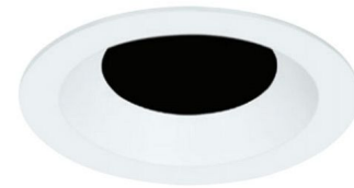
Shown in white / no lens

APERTURE SIZE . . . . . 2.800" APERTURE SHAPE . . . . . Round CEILING TYPE . . . . . Drywall with Trim FUNCTION . . . . . Downlight