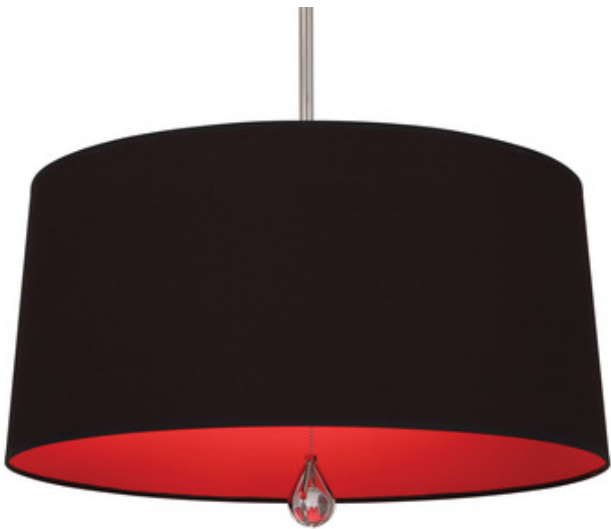
Shown in: Polished Nickel / Blacksmith Black / Richmond Red

Custis Pendant, part of the Williamsburg Collection, is a simple piece with a classic touch and a variety of colors, perfect for any room in your home. Features a crystal drop final and a polished nickel or modern brass finish with shades available in Blacksmith Black with a Richmond Red lining, Richmond Red with a Blacksmith Black lining, Revolutionary Storm with a Parrot Green lining, Parrot Green with a Revolutionary Storm lining, Revolutionary Storm with a William of Orange lining, William of Orange with a Revolutionary Storm lining, Ludwell Lilac with a Greenhow Grape lining, Greenhow Grape with a Ludwell Lilac lining, Carter Grey with a Mayo Teal lining, Mayo Teal with a Carter Grey lining, Carter Gray Fabric shade with Ink Blue lining, and Ink Blue Fabric shade with Carter Gray lining. 61.25 inch maximum length. UL listed.