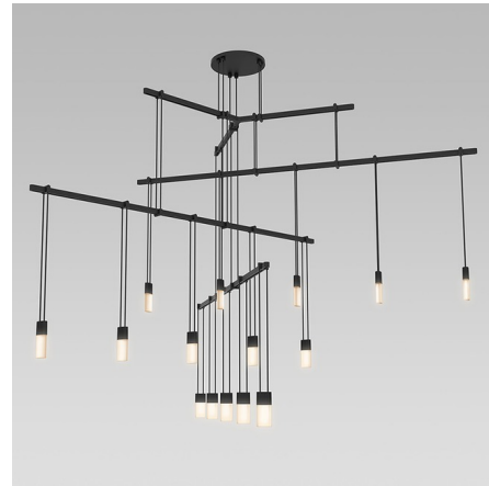
Shown in satin black

Tri-Bar suspends luminaires at staggered heights from a 120-degree Tri-Bar to form this luminous array of minimalist simplicity. Available with a Satin Black finish. ETL and UL listed. Luminaire 1: 15 x Etched Chiclets Transformer Location: Outlet Box